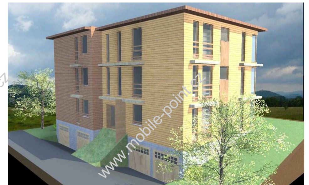
VIZUALIZACE / POHLEDY